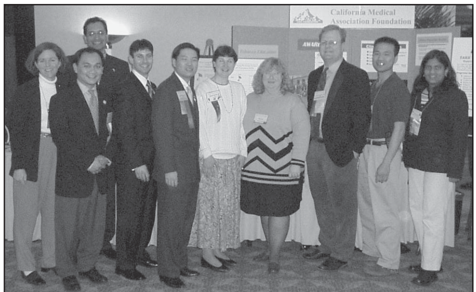
The doctors in the picture are from left to right:

The YPS looks forward to next year's raffle.